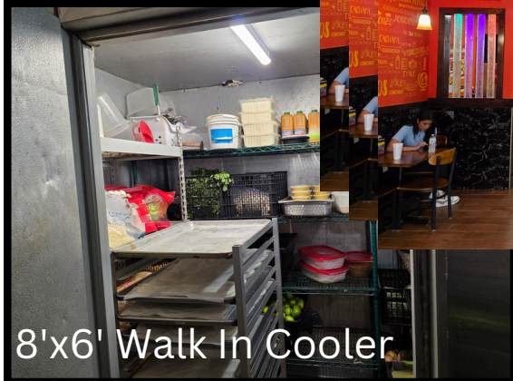
8'x6' Walk In Cooler