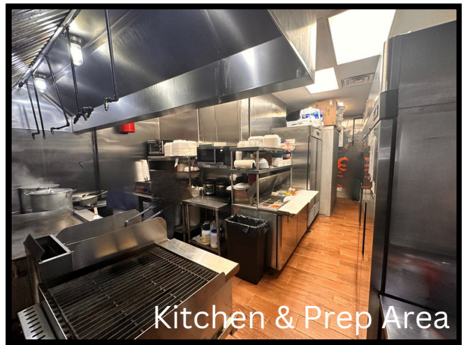
Kitchen & Prep Area