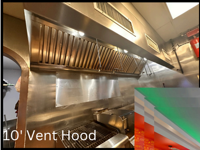
10' Vent Hood