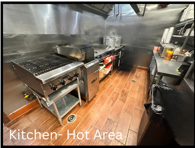
Kitchen- Hot Area