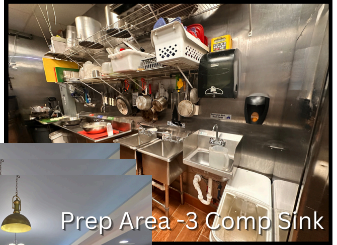
Prep Area - 3 Comp Sink