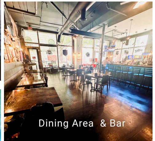
Dining Area & Bar