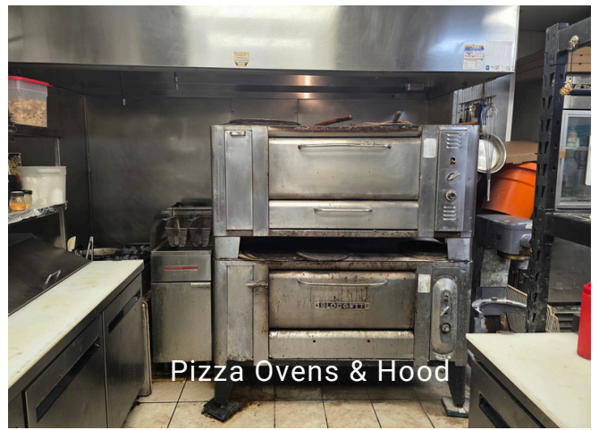
Pizza Ovens & Hood